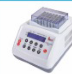
DRY BATH INCUBATOR