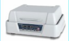
4 PLATE INCUBATING SHAKER