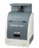
GEL DOCUMENTATION SYSTEM