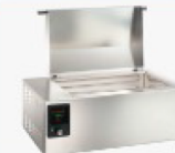
WATER - OIL BATH