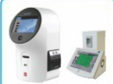
AUTOMATED CELL COUNTER