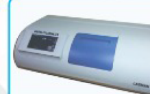
AUTOMATIC DIGITAL POLARIMETER