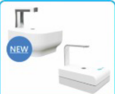
LIVE CELL IMAGER