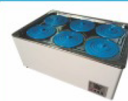
DIGITAL WATER BATH