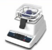
CELL / TISSUE HOMOGENIZER