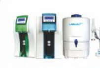
WATER PURIFICATION SYSTEMS