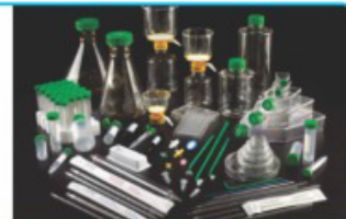
CELL CULTURE CONSUMABLES