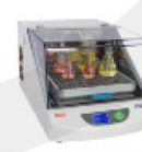
ORBITAL SHAKING INCUBATOR