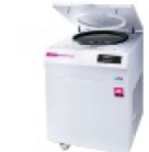
FLOOR MODEL REFRIGERATED CENTRIFUGE