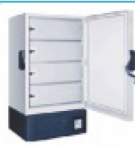
DEEP FREEZER (-20/-40/-80 DEGREE)