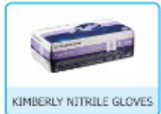
KIMBERLY NITRILE GLOVES