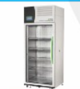
FREEZE / THAWING CHAMBER